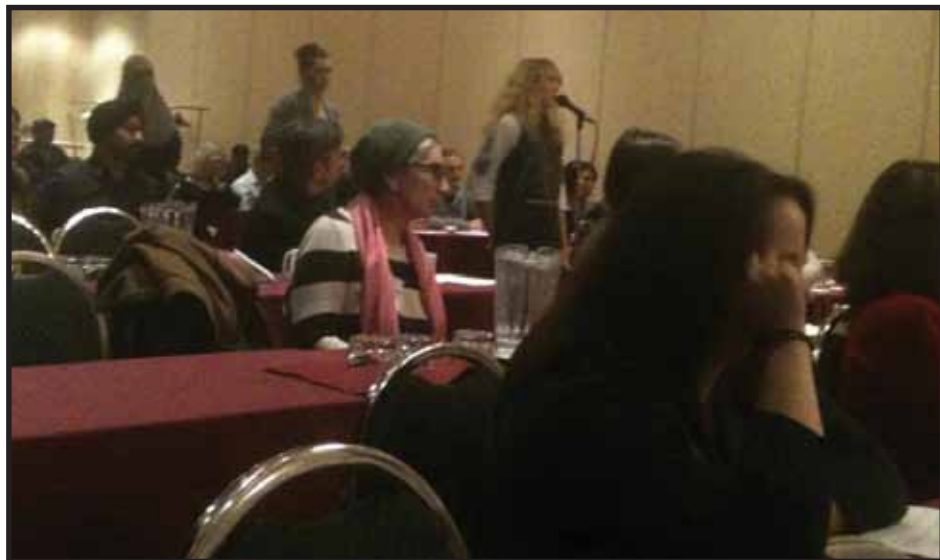
Attendees at Toronto Meeting

I want to thank the Wilson's Disease Association for an absolutely wonderful birthday party- the best ever. Let me end with one birthday wish. It is my wish that everyone send a donation to the WDA so that it can continue with its work to ensure that every Wilson's patient reaches 64 years old and beyond.